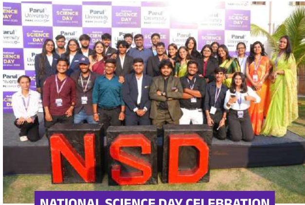
NATIONAL SCIENCE DAY CELEBRATION