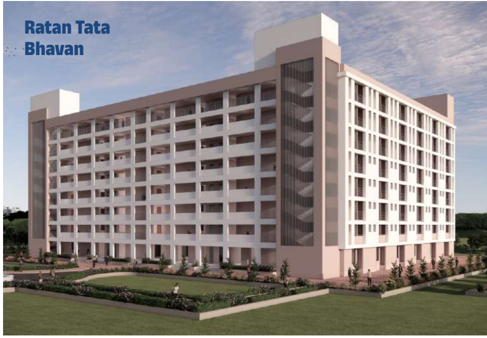
Ratan Tata Bhavan

The introduction of Abraham Lincoln Hostel and Ratan Tata Bhavan expanded residential facilities, offering comfort, accessibility, and a balanced campus lifestyle. Dedicated study areas, modern amenities, and nearby recreational spaces support both academic focus and student well-being.