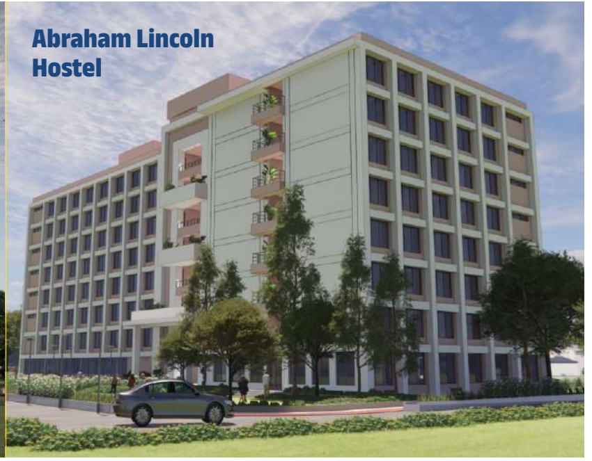
Abraham Lincoln Hostel